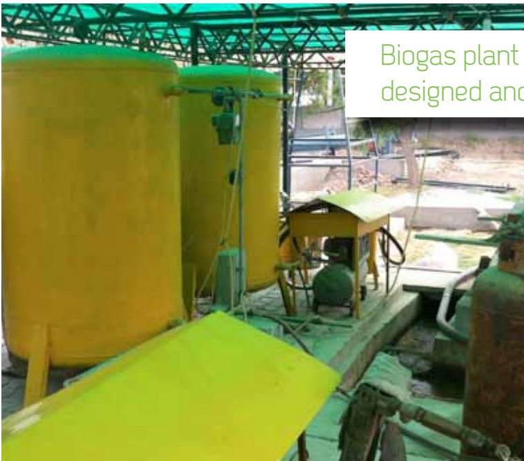
Biogas plant that UAF has designed and installed